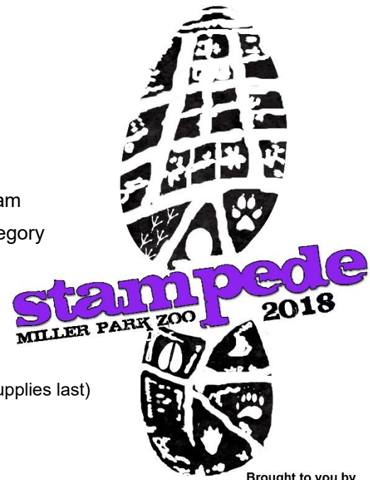
Brought to you by Miller Park Zoological Society

4:00-6:00 pm March 2: Pre-Packet pick up at Miller Park Pavilion or 8:00-9:15 am March 3, in the Miller Park Pavilion . No registration after 9:15am