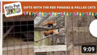
Gifts with our Red Pandas and Pallas Cats

A Special thank you to our Digital Sponsor