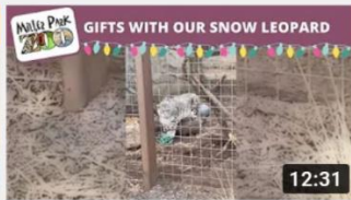
Gifts for our Snow Leopard Miller Park Zoo