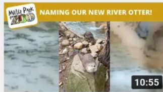
Naming Our North American River Otter

Zoo live streams and other video content ▶ PLAY ALL